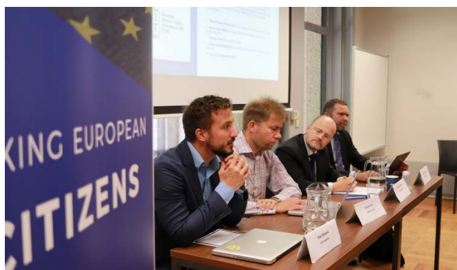
Summer University Opening panel

The fourth edition of the ECIT (European Citizens' Rights, Involvement and Trust) Foundation's Summer University on European Citizenship, co-organized for the first time in cooperation with the Institut d'études Européennes (IEE) of the Université libre de Bruxelles on 2-3 September 2019, brought together policy-makers, civil society activists and members of the academia to discuss and set the priorities for the development of European citizenship in the new term of European institutions. High-ranking officials of the Commission, MEPs, professors and even a judge from the Court of Justice of the EU were unified in demanding 'More European Citizenship'!