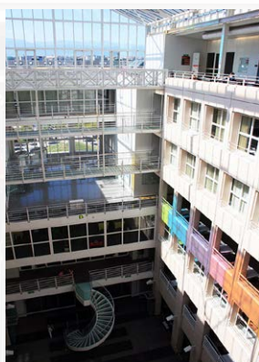
Uni Mail Library, University of Geneva